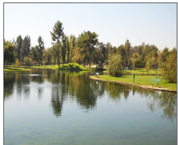
A three acre lake at Craig Regional Park provides an ideal setting for fishing, model boating and bird watching.