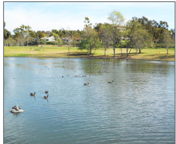
Water clarity and quality has improved at Mason Regional Park's lake under a new maintenance program, creating an inviting home for waterfowl.

The end result has been a decrease in complaints from the public and a number of compliments on the improvements. By taking a regional view on the maintenance of lakes in the OC Parks system, the public's enjoyment of the parks has increased, wildlife habitat has improved and an important award has been bestowed on OC Parks for their creative approach to solving a maintenance challenge. ■