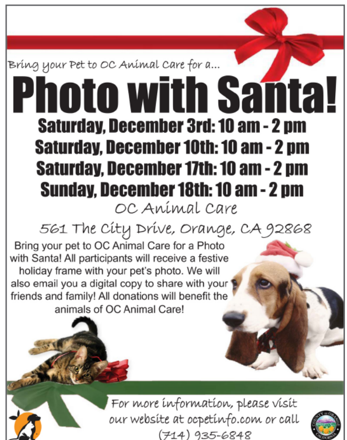
Photo with Santa

The Business Council created the Red Carpet awards program to recognize outstanding public agencies that are proactively cutting through the red tape and improving the local business climate through innovative projects, cutting regulations, reducing fees and streamlining processes. Other local governments receiving awards included the cities of Anaheim, Huntington Beach, Irvine and Newport Beach, and the Anaheim Union High School District. ■