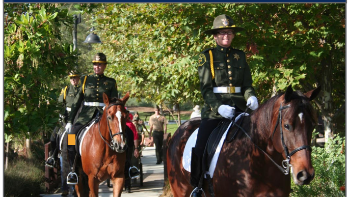
A mounted unit from the Orange County Sheriff's Department led the way for participants in the Walk Against Drugs.