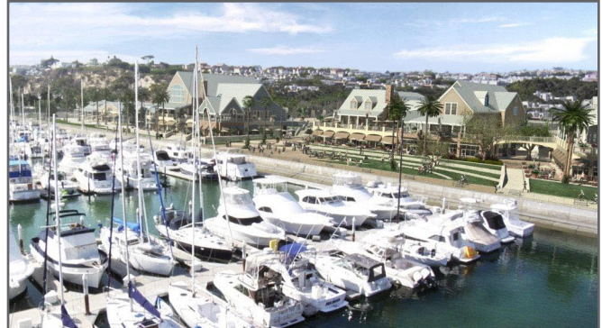
Improvements are also planned for the harbor's boat slips and other waterside enhancements.

At an October 6 meeting at Huntington Beach City Hall, the California Coastal Commission voted unanimously to take the final step in the certification of the Local Coastal Program Amendment (LCPA) for the Revitalization of Dana Point Harbor. The Dana Point Harbor Revitalization can now move forward to the next phase of Coastal Development Permitting, which will include other opportunities for public involvement and public comment.