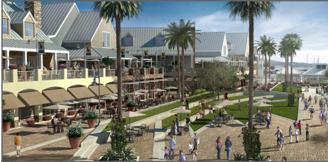
Landside improvements are part of the plan for the Dana Point Harbor Revitalization, which has received an important certification from the California Coastal Commission.