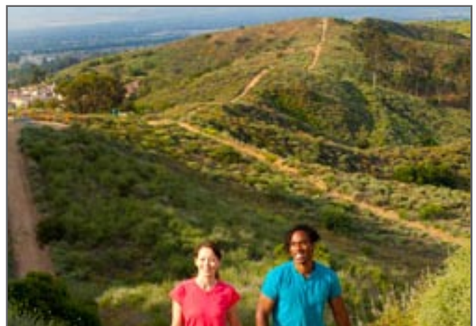
Peters Canyon Regional Park was recently voted the best place to hike by OC Register readers.