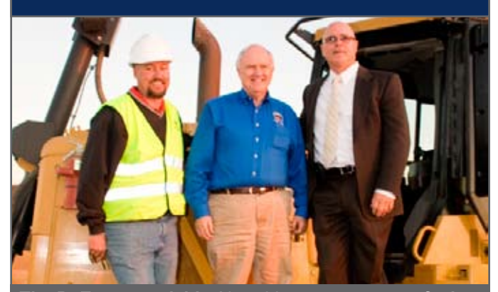
The D7E tractor yields 10 to 30 percent greater fuel economy using an electric drive system. <u>Click here</u> to see slideshow. (If a security window appears, select "allow.")