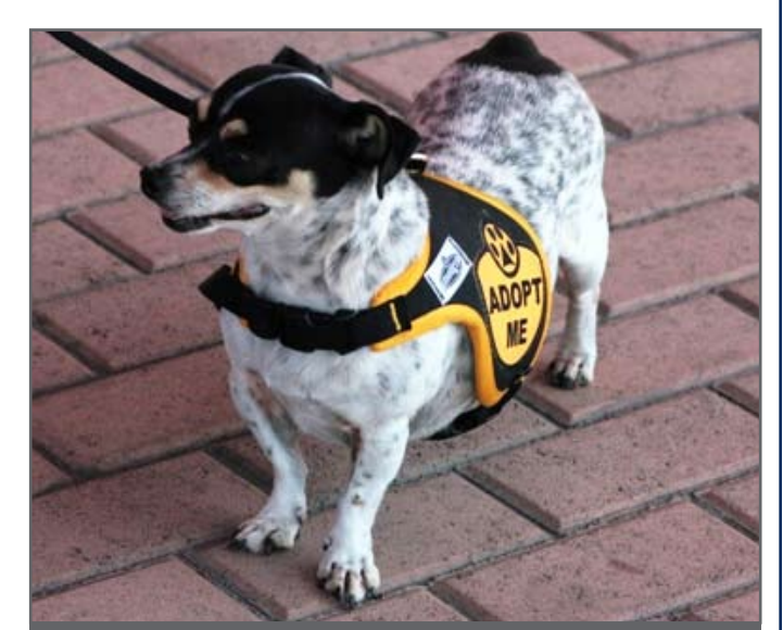
Magnolia models her "Adopt-Me" vest at OC Animal Care's Angels for Animals event. <u>Click here</u> to see slideshow. (If a security window appears, select "allow.")