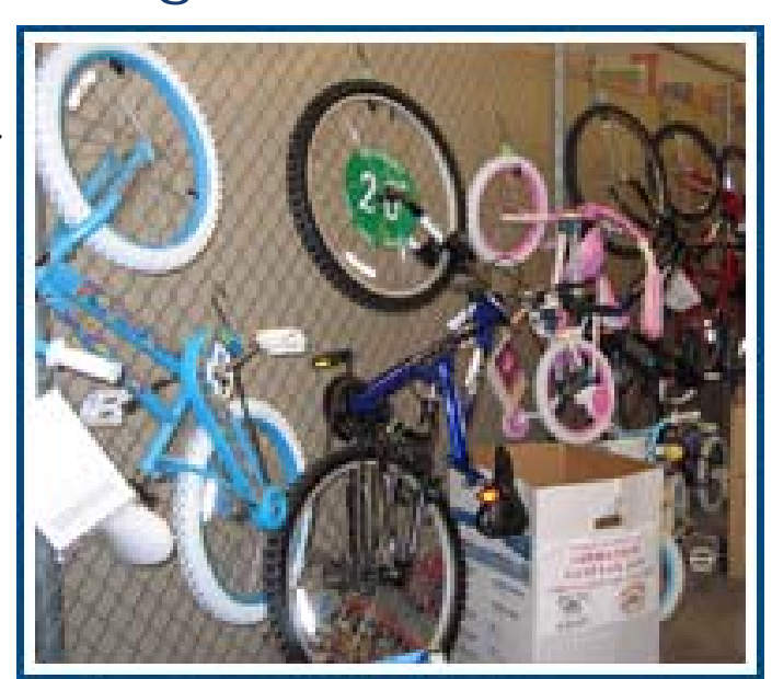
Donated bicycles line the Operations Santa Claus warehouse. Gifts of all sizes will be handed out to underprivileged children and teens.

Gifts for both programs are gathered through a collaborative effort of County agencies. Angel tags suggesting a gift for a specific age and gender will soon appear in County buildings along with gift collection boxes. Each Public Library branch will also have gift collection boxes that will be delivered each day to the Operation Santa Claus warehouse.