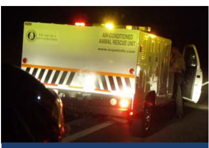
Animal Rescue Unit providing services during the fire