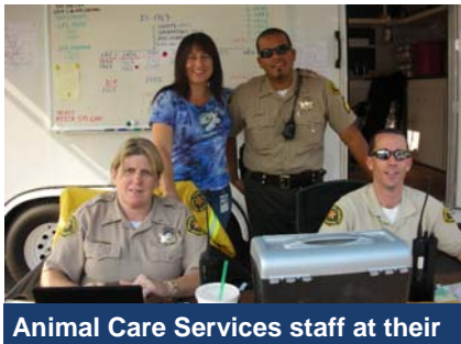
Animal Care Services staff at their Emergency Response Unit trailer