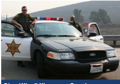
Sheriff's Officers at Santiago Road