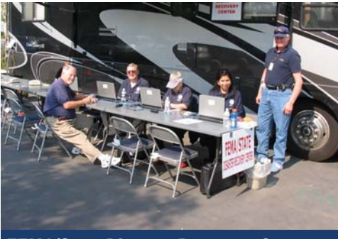
FEMA/State Disaster Recovery Center unit located outside the Irvine Local Assistance Center