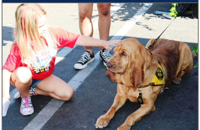
The Sheriff's Department bloodhound was a big attraction for children at the South County Disaster Preparedness Expo.