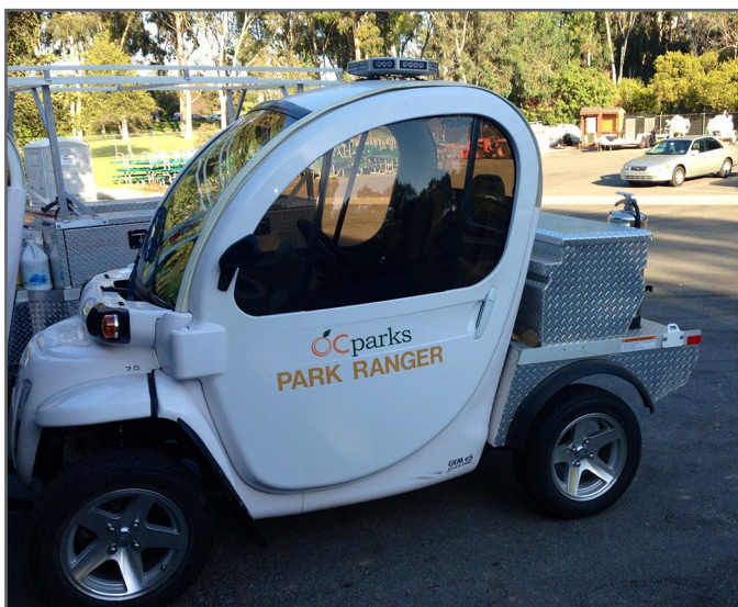
Quiet, efficient and highly maneuverable are some of the words used to describe this electric vehicle used by OC Parks rangers.

As with anything new, there has been a learning curve, and staff quickly identified the need for higher voltage chargers that allow the vehicles to be recharged in a shorter period of time. The electric vehicles have allowed OC Parks to surpass their goal of reducing the number of gasoline powered vehicles used by the department by 30% and fit with a growing industry trend to use "greener" vehicles that reduce our impact on the environment. ■