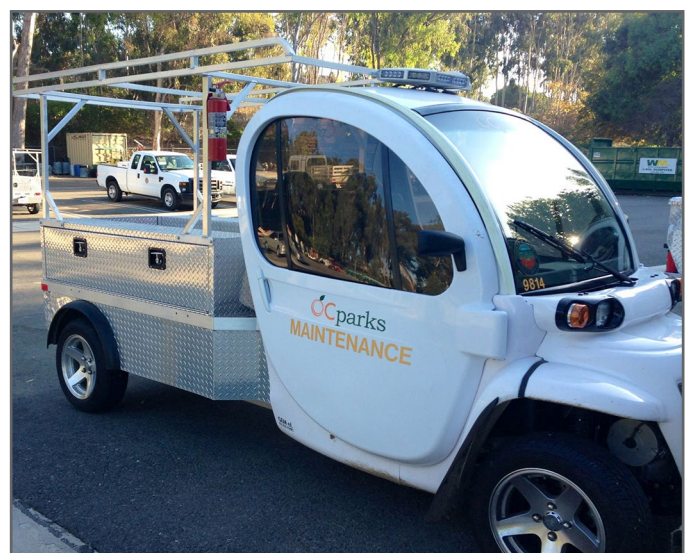
Electric vehicles can be configured to handle a variety of common tasks performed by OC Parks staff.