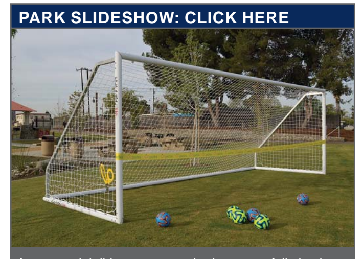
A ceremonial ribbon was stretched across a full-sized soccer goal at the grand re-opening of the Haster Basin Recreational Park. Please click here to enjoy additional photos from the event.

Although the park serves as an excellent new addition for the community, the primary purpose of the facility is for flood control. The Haster