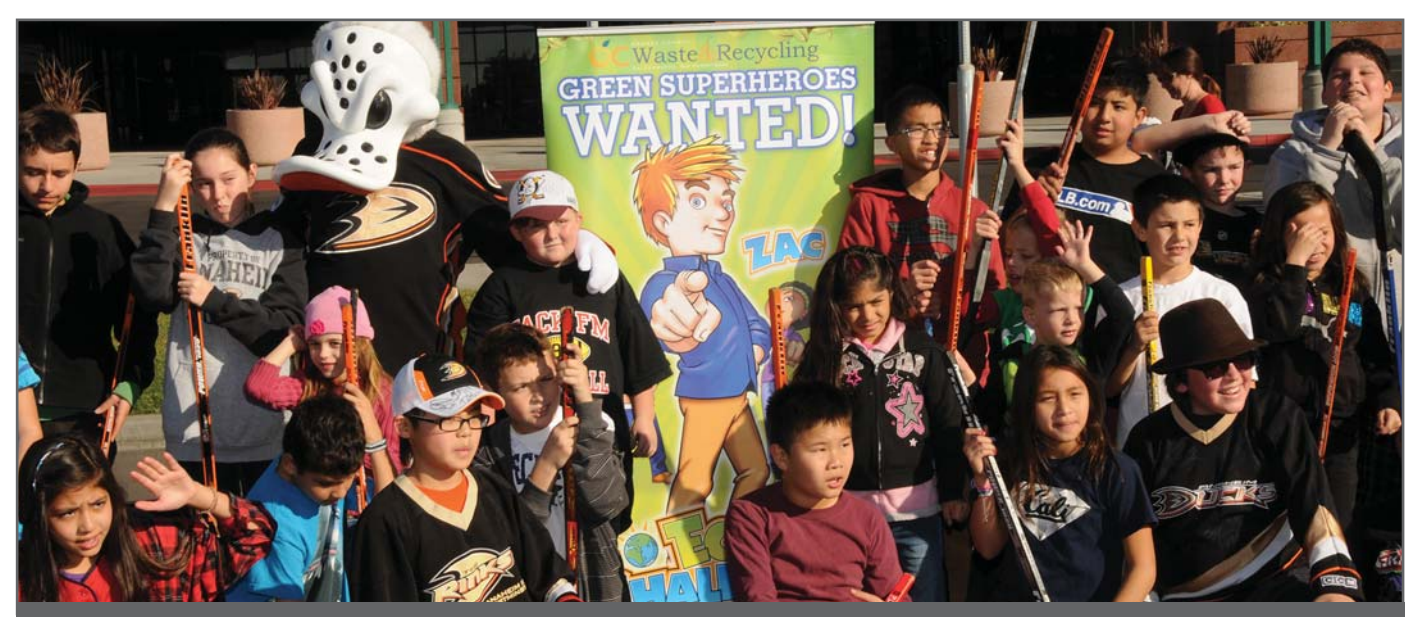
The festive atmosphere at Eco Challenge Recycling Day was highlighted when the youth in attendance called for all of us to "Take the Eco Challenge!"

On Saturday, February 1, cars began lining up at the Honda Center in Anaheim around 5:30 in the morning. One family made it a special occasion by staying in a hotel across the street overnight to ensure a prime spot for the main attraction – a household hazardous waste, e-waste and used clothing disposal event. By day's end, more than six and a half tons had been collected at OC Waste & Recycling's (OCWR) Eco Challenge Recycling Day.