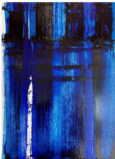
BHELBHELYNDE 1.0 - 2020