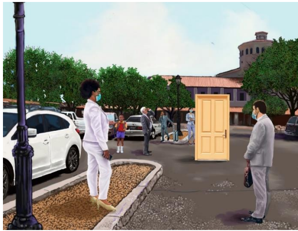
The Door , Digital Painting, 2023